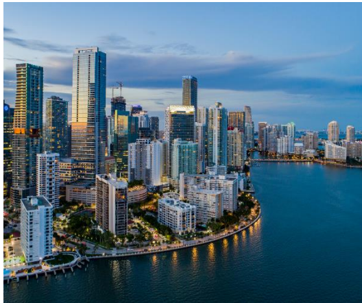
Promotional video by Skål International Miami