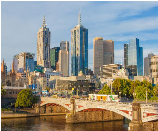
Club of the Year 2021/2022 Skål International Melbourne