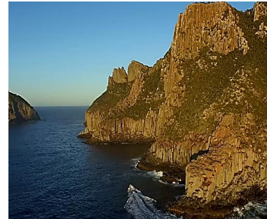
Members testimonials Skål International Hobart